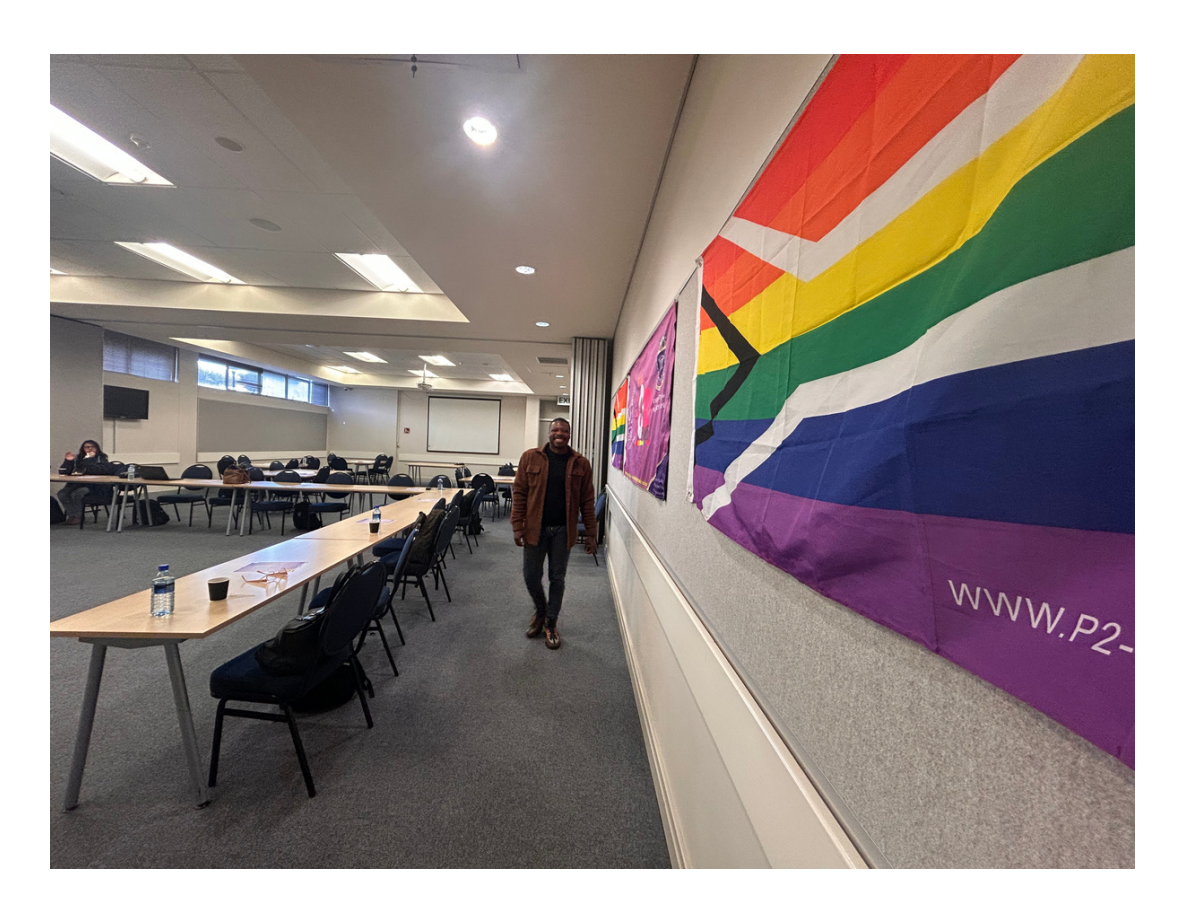
PICTURED: Scotti helping with set up for a educational training given by GEU members.