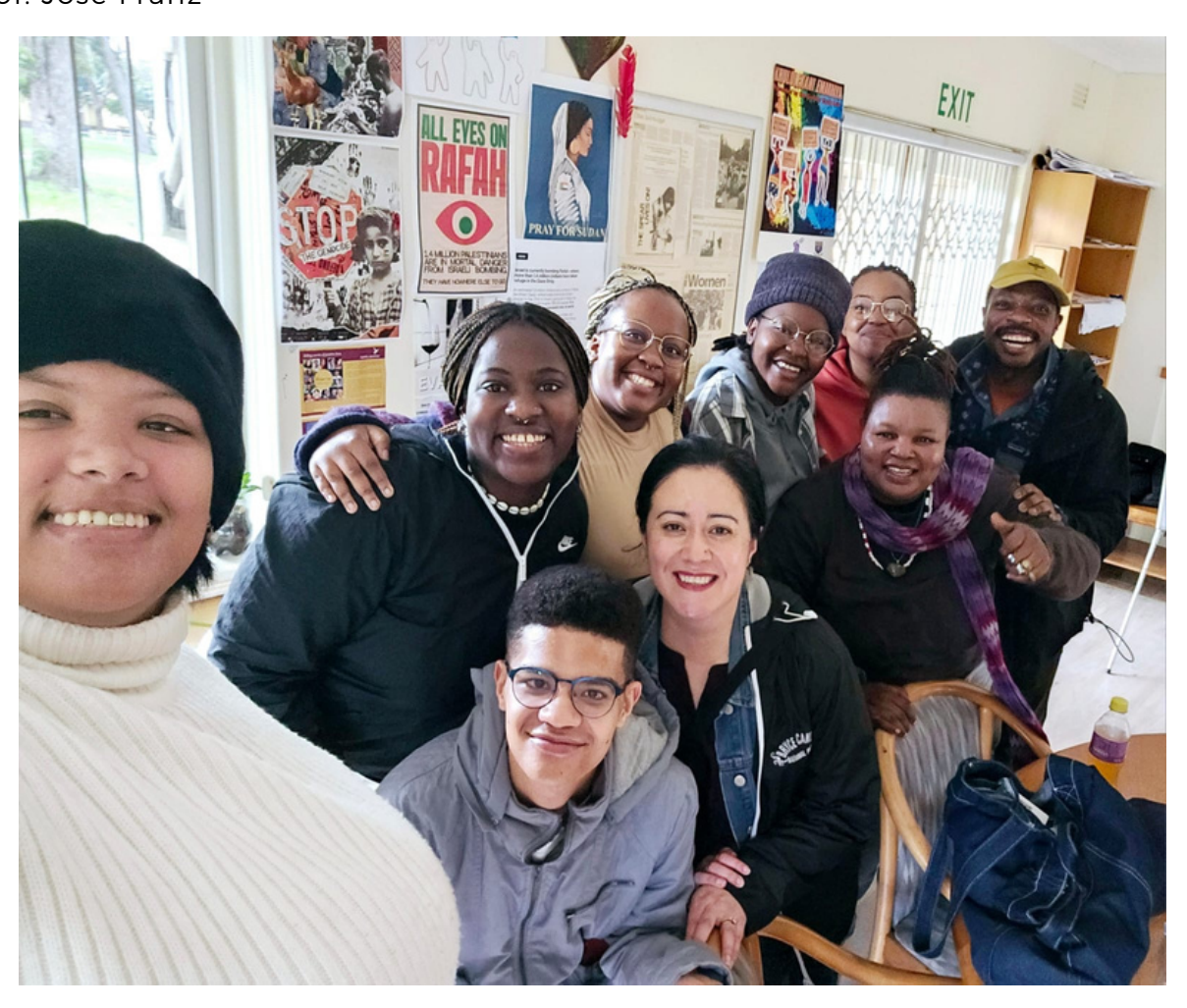
PICTURED: Student volunteers at the GEU