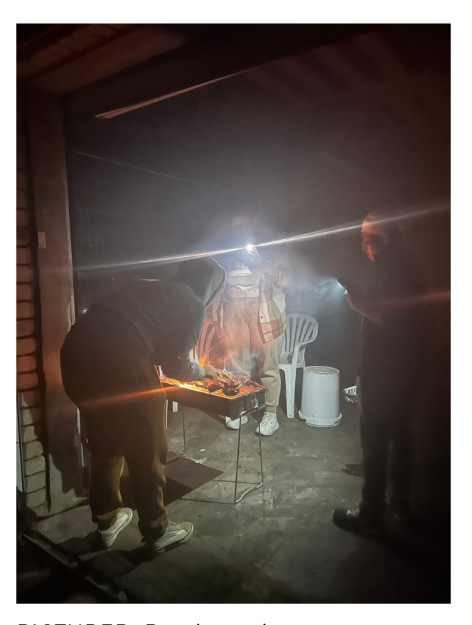
PICTURED: Braai evening