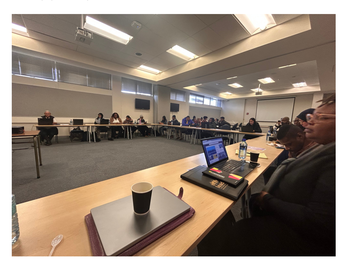
PICTURED: Educational training given by GEU members