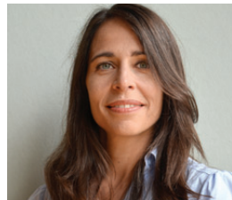
S. Kritzinger (©SHS)

Requirements: Performance will be assessed on the basis of attendance and participation in class discussions (20%), a role play taking different party positions and government negotiations into account (40%), and a written final exam (40%).