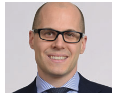
C. Koller (© Paris Zizos)