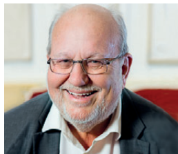
K. Vocelka

Requirements: Attendance and participation in class discussion constitute 30%, a short paper 30% and a written final (essay-type) 40% of the grade.