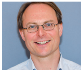
E. Gnan (@SHS)

This course is regularly organized with the support of the Oesterreichische Nationalbank (Austrian Central Bank).