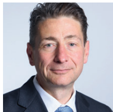
N. Forgó

Requirements: Regular attendance and active participation in class discussions (40%) and an open-book essay exam (60%).