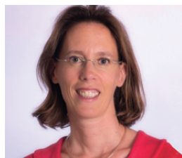
C. Kwapil (© Oesterreichische Nationalbank)